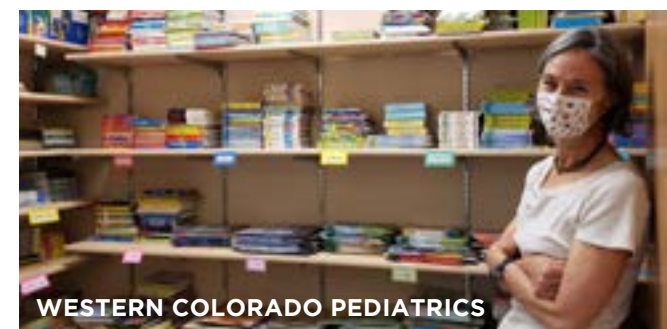
WESTERN COLORADO PEDIATRICS

The healthcare clinics we work with are invested in their partnership with Reach Out and Read Colorado, now more than ever before. Their small financial contribution to the program results in improved fidelity and deeper impact. We are excited to share in the mission and passion of the work our medical providers do every day.